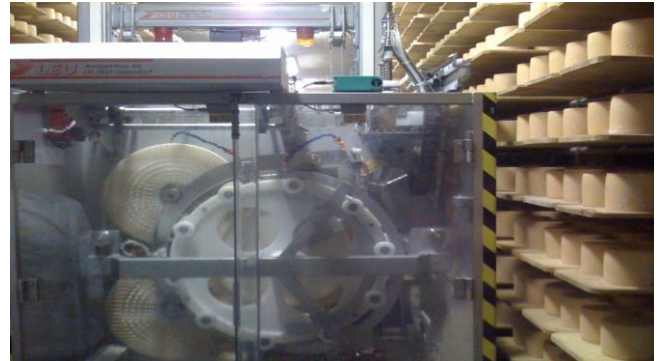
PhageGuard Listex is applied at the point of slicing which potentially is a vulnerable point of contamination.

A typical application; PhageGuard Listex is added to the ripening culture to protect the smearing robot against cross contamination during brushing and washing, see photo below.